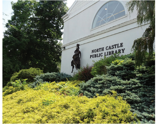
North Castle Public Library